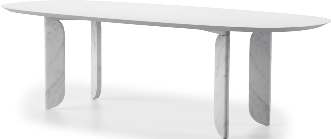
■ T873003XNA (draft image)

ALL PICTURES SHOWN ARE FOR ILLUSTRATIVE PURPOSE ONLY. ACTUAL PRODUCT MAY VARY DUE TO PRODUCT ENHANCEMENT.