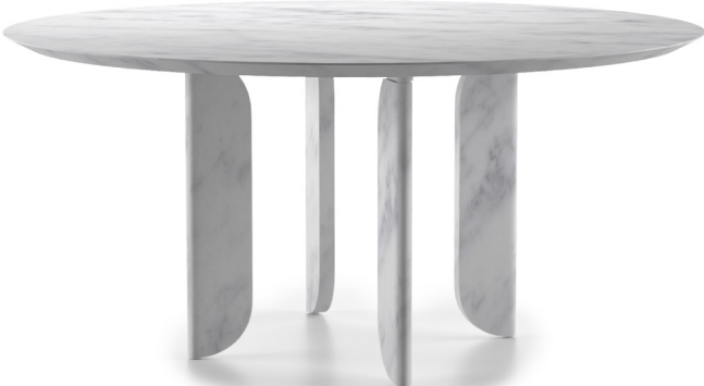
■ T873001XNA (draft image)